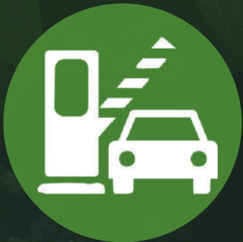
FAST TAG RECHARGE